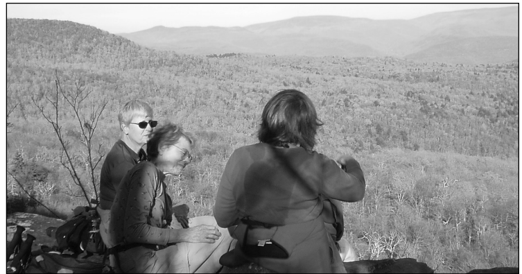
Enjoying the view in Harriman State Park