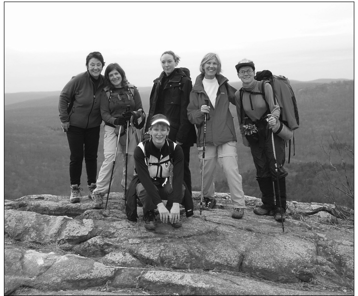
The Timp in Harriman State Park