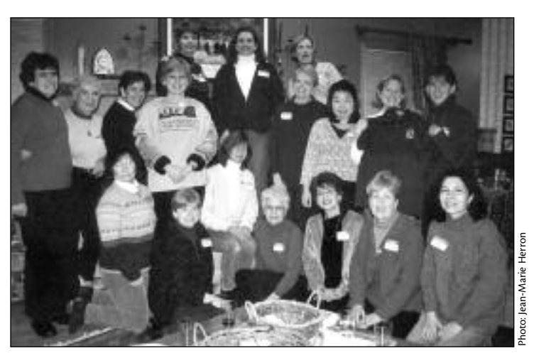
On January 30th we had our annual Pot Luck dinner at AFW HQ's in Morristown, NJ. Approximately 25 women were on hand for good food and good fun. Mark your calendars for August 22nd when we have our first Summer Pot Luck BBQ!